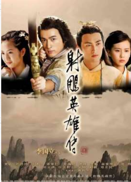
The Legend of The Condor Heroes