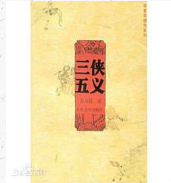
Three Heroes and Five Gallants