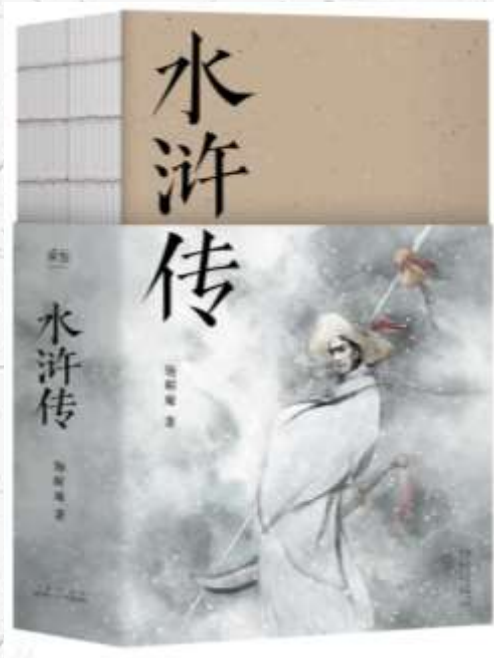
All Men Are Brothers

Features:Emphasizing loyalty to the monarch and serving the country and the people