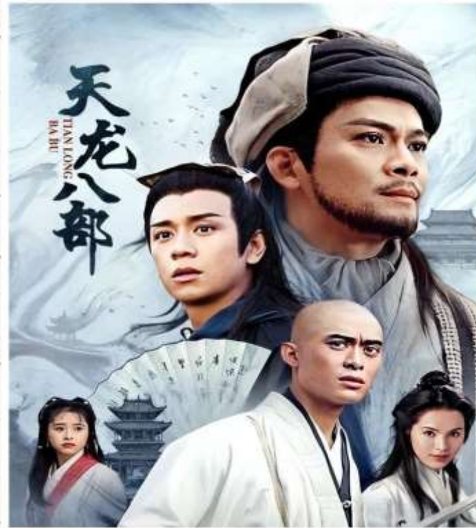
Demi-Gods and Semi-Devils