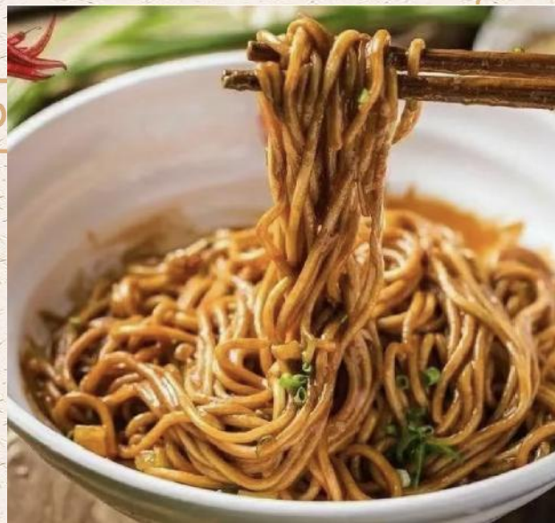
Hot Dry Noodles